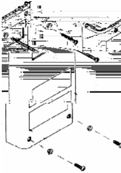
F 1 1